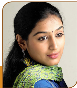
Ms. Padmapriya Indian Film Actress